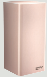
Rose Gold DD50V-RG